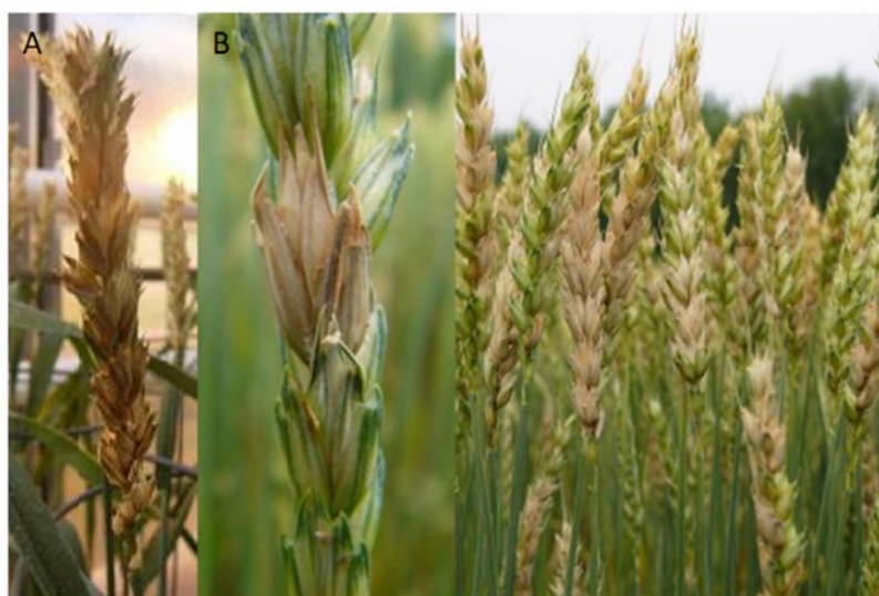
Fig. 2. Development of Fusarium head blight on wheat ears after inoculation with macroconidia of F. graminearum produced with the improved method. A: greenhouse; B: field experiments

a. ng fungal DNA per mg kernel dry weight; b. Conventional method of inoculum production; c. Improved method of inoculum production; *. 1 = no infection, 2 = <5; 3 = 5-15; 4 = 16 to 25%; 5 = 26 -45%; 6 = 46-65%; 7 = 66 - 85%; 8 = 86 - 95%, 9 = 96 - 100% of bleached spikelets; **. Significantly different from conventional method (t-test, p \leq 0.05 ).